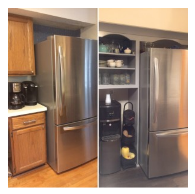
Shout out to Primo Waterlove that my family drinks and cooks with this clean and refreshing bottled water.

I also want to give a shout to to <u>Primo Water</u>- I actually designed the cabinets around my refrigerator to house the <u>bottom-loading water cooler</u>. I love it for easy access to clean water! I use it for hot tea at least once a day. My boys go to it all day for cold water (or room temperature, depending what your teeth prefer!). I also feel good cooking with it. With all the crazy stories on the news right now about tainted water, I feel really good about getting big jugs of Primo for my family instead of tap water. (The bottles are easy to exchange at places like Harris Teeter, Kroger, Lowe's Home Improvements, etc.)