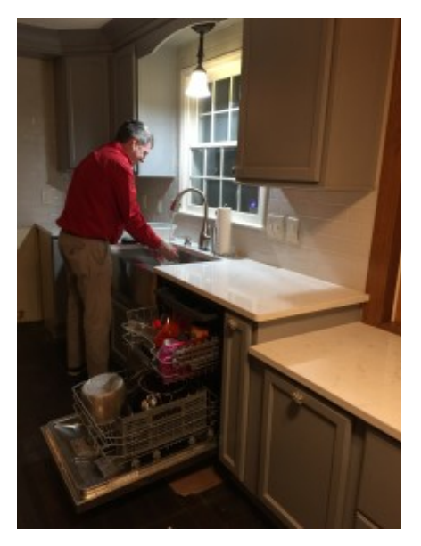
Such a dreamy sight!

Thursday: Today was all about regaining functionality. After nine weeks, I think I am most excited to have running water in the kitchen again! Yes, I realize that I had it in other places in the house, but I am so done with washing dishes in the basement bathroom! (SHOUT OUT TO MY HUBBY SINCE HE DID MOST OF THE DISHWASHING!!) My sink and dishwasher are up and running. And— so are my electrical outlets! I can plug it to a gazillion different places now, so you can anticipate seeing crockpots lining the kitchen at some point in the near future. Haha! (GRILLED CHICKEN AND KALE BURGERS AND FRESH ZUCCHINI TONIGHT...AND A FEW OTHER THINGS IN PREPARATION FOR THE SNOW TOMORROW!)