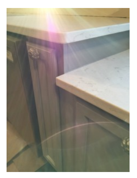
Even the sun wanted to catch a glimpse of

Tuesday: <u>Carolina Custom Surfaces</u> did a beautiful job installing my new countertops on a very cold day. The guys were courteous and skilled. I love it when people show up to work but take a minute to just step back and admire the progress before they begin. This isn't just an office, this is my home, too. I appreciated that the guys asked me my opinion, like on faucet preferences, and even had great recommendations for counter cleaners (they totally recommended <u>THIS</u> and <u>THIS</u> to keep my quartz clean and pretty.)