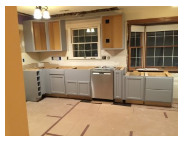
The cabinets are in- but TOPLESS!

I should back up and cheer before I complain. In Week Six, the cabinets were installed. Can I get a "hell yeah" from the crowd?! (hell. yeah.) Thanks. Finally, real progress. They are beautiful and clean and I am amazed how easy it looks but how many excrutiating, intricate details are necessary to make it all look just right. (LUCAS- IF YOU READ THIS, YOU ARE AMAZING.)