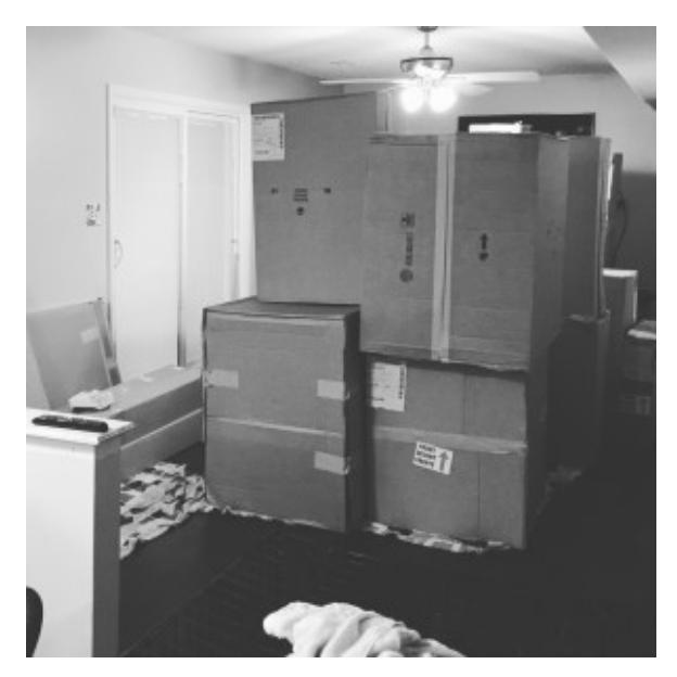
The cabinets arrived three weeks early, can you believe