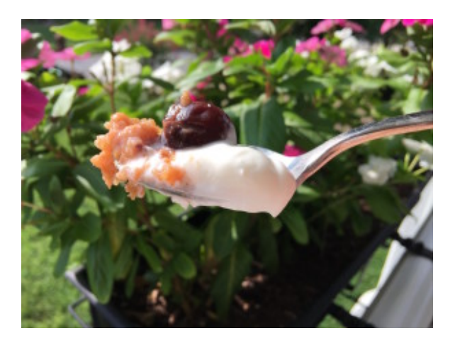
This dish is an easy overnight breakfast for those early weekday mornings.

We are almost a month into school, some of you are just starting out post-Labor Day, and I'm pretty sure we can all agree that mornings are rough! (BTW- If I have to see one more picture on social media of some super mom decorating chalkboard coated cookie sheets announcing the new grade and "what I want to be when I grow up", I'm seriously going to get one of those old school bumper stickers that said "my kid beat up your honor student".)