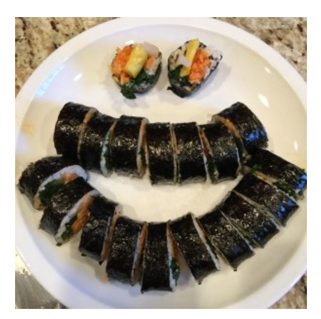
Once you learn to make the rolls, the possibilities are endless. So many different filling combinations to try!

(To do these as just meatballs, roll into golf balls and then bake in the oven— they get a really nice crispiness to the outside.)