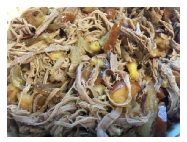
After cooking for 6 hours on LOW, use two forks to easily shred the meat.

1 large gala apple, sliced into 1/3 inch strips, skins left on 1/2 sweet onion, sliced the same thickness as the apples