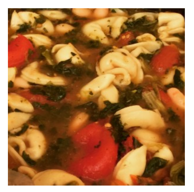
It's easy to keep all of these ingredients on hand for a delicious dinner anytime!

On Friday and Saturday, we worked on THX dinner leftovers. I also made <u>Crock Pot Chili</u>— it's the easiest recipe ever. You might have also seen my <u>Crock Pot Tortellini Soup</u> on social media, that was a huge hit.I used <u>this recipe</u>, but also added a can of white beans to add more protein. It's so easy and there was no prep work and no clean up. The ingredients for both of these meals are easy to keep on hand in the pantry and freezer and I recommend adding them to your next shopping trip.