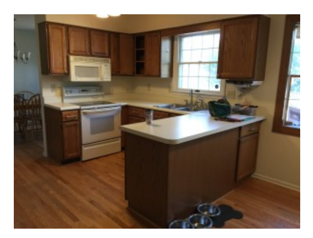
This is the last picture I took of my old kitchen before we started tearing it apart.

I cook. I am not a trained cook, but it's my favorite thing to do for my family, my friends and my fans. I just needed a better place to do it all.