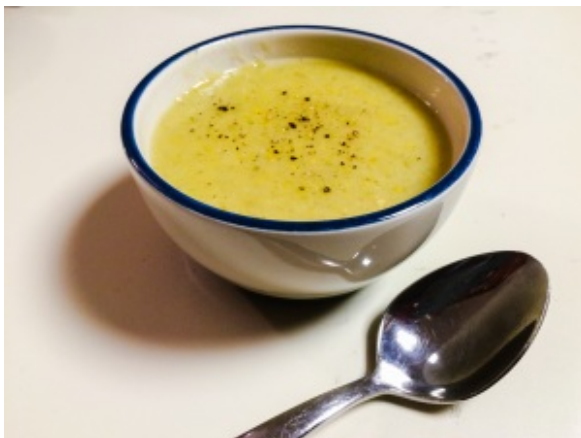
Crock Pot Celery and Leek