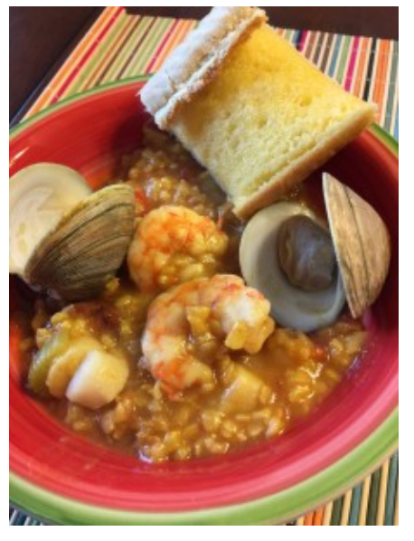
This one pot dish is literally named for being made in a pot. It's the original one-dish cuisine.

This, my friends. This is the quintessential dinner that melds together land and sea and balances the forces of nature to create an amazing meal that would make even mermaids and pirates cheer. With more protein than a Brazilian meat festival, this one pot recipe will make you lift your anchors and set full speed ahead toward the coast. And you'll thank me for it. I thanked me for it- I've never made this dish before, but with so much fresh seafood available here in the Outer Banks, it was a challenge I was eager to attempt and declare victory for all.