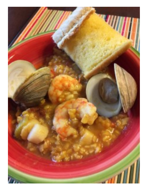
This one pot dish is literally named for being made in a pot. It's the original one-dish cuisine.

This, my friends. This is the quintessential dinner that melds together land and sea and balances the forces of nature to create an amazing meal that would make even mermaids and pirates cheer. With more protein than a Brazilian meat festival, this one pot recipe will make you lift your anchors and set full speed ahead toward the coast. And you'll thank me for it. I thanked me for it— I've never made this dish before, but with so much fresh seafood available here in the Outer Banks, it was a challenge I was eager to attempt and declare victory for all.