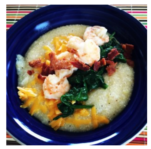
I like to make a simple crock pot of grits and then provide a buffet of toppings!

I might have found flirty peaches at the weekly Farmer's Market this morning, but we still need to have dinner, right?! Good thing I decided to make a big ol' batch of crock pot grits to cook low and slow all day. I mean, come on... it's three ingredients. That's barely even a recipe. So let me also tell you about the toppings I made for our grits bar tonight.