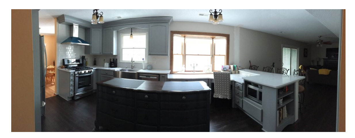
Check out this beautiful panoramic of the new kitchen with all of the upgrades.

There are some small details to still finish (like painting the bay window), but overall, I could not be more thrilled with THIS: