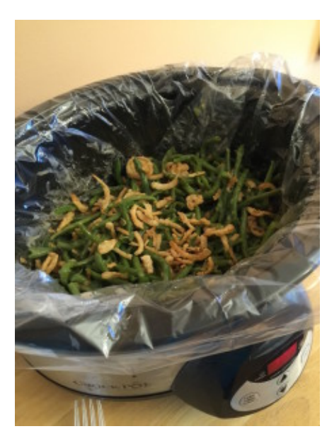
Here's an easy way to free up space in your oven when you are making Thanksgiving dinner.

While most of you are probably brining your turkeys, whipping your cream, or stuffing that bird, we're being a little non-traditional with our family time this holiday season. Yes—we will still eat a full Thanksgiving dinner, but no… the renovation is not complete. No kitchen? No problem!