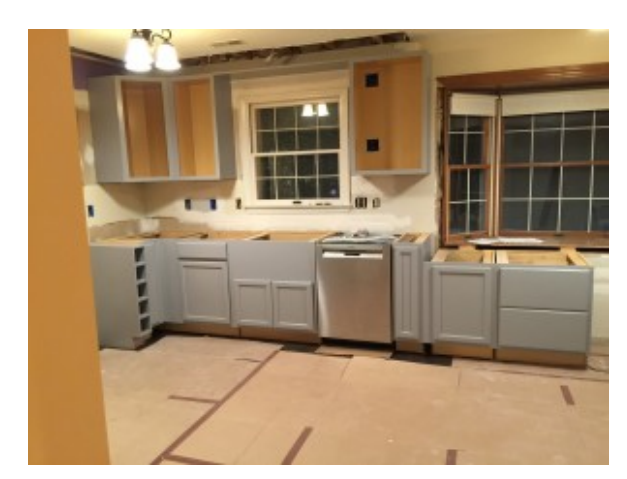
The cabinets are in— but TOPLESS!

I should back up and cheer before I complain. In Week Six, the cabinets were installed. Can I get a "hell yeah" from the crowd?! (hell. yeah.) Thanks. Finally, real progress. They are beautiful and clean and I am amazed how easy it looks but how many excrutiating, intricate details are necessary to make it all look just right. (LUCAS- IF YOU READ THIS, YOU ARE AMAZING.)