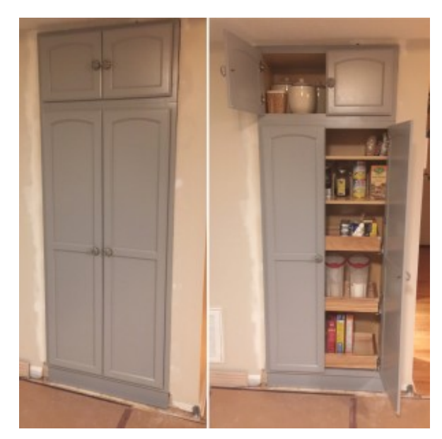
We expanded the small pantry space and added drawers and doors. I love the easy access now!

Shortly after the cabinets were hung by the sink with care (yes, St. Nicholas had recently been there), Carolina Custom Surfaces came to take the measurements for my countertops. They used some of the coolest technology and gadgets that I've ever seen— again, wizardry! Freaking laser beams to measure the space, the angles, the cuts. I don't mean to overestimate here, but I am anticipating sheer perfection from this process.