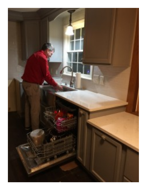
Such a dreamy sight!

Thursday: Today was all about regaining functionality. After nine weeks, I think I am most excited to have running water in the kitchen again! Yes, I realize that I had it in other places in the house, but I am so done with washing dishes in the basement bathroom! (SHOUT OUT TO MY HUBBY SINCE HE DID MOST OF THE DISHWASHING!!) My sink and dishwasher are up and running. And— so are my electrical outlets! I can plug it to a gazillion different places now, so you can anticipate seeing crockpots lining the kitchen at some point in the near future. Haha! (GRILLED CHICKEN AND KALE BURGERS AND FRESH ZUCCHINI TONIGHT...AND A FEW OTHER THINGS IN PREPARATION FOR THE SNOW TOMORROW!)