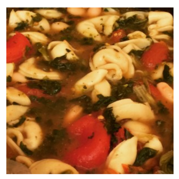
It's easy to keep all of these ingredients on hand for a delicious dinner anytime!

On Friday and Saturday, we worked on THX dinner leftovers. I also made <a href="Crock Pot Chili">Crock Pot Chili</a>— it's the easiest recipe ever. You might have also seen my <a href="Crock Pot Tortellini Soup">Crock Pot Tortellini Soup</a> on social media, that was a huge hit. I used <a href="this recipe">this recipe</a>, but also added a can of white beans to add more protein. It's so easy and there was no prep work and no clean up. The ingredients for both of these meals are easy to keep on hand in the pantry and freezer and I recommend adding them to your next shopping trip.