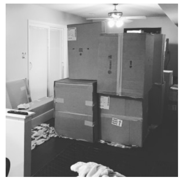
The cabinets arrived three weeks early, can you believe