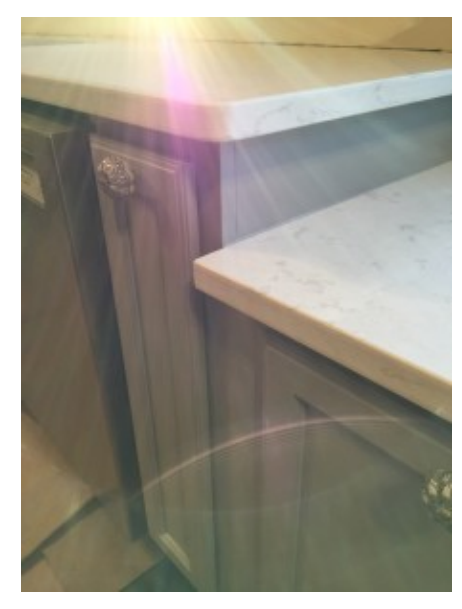
Even the sun wanted to catch a glimpse of

Tuesday: Carolina Custom Surfaces did a beautiful job installing my new countertops on a very cold day. The guys were courteous and skilled. I love it when people show up to work but take a minute to just step back and admire the progress before they begin. This isn't just an office, this is my home, too. I appreciated that the guys asked me my opinion, like on faucet preferences, and even had great recommendations for counter cleaners (they totally recommended THIS and THIS to keep my quartz clean and pretty.)