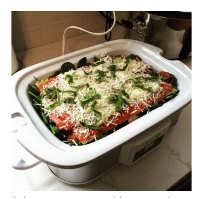
This one-pot dinner is a great meat-free option that leaves you full and satisfied.

So after doing a little research, I've figured out that crock pot lasagna is very doable. Not only can you assemble it in the pot, but I am convinced that most of the cooking should take place in the pot, too. This dish is easy to cook, doesn't take more than an afternoon to finish and you can even freeze the leftovers for another night. That is, if there are any leftovers!